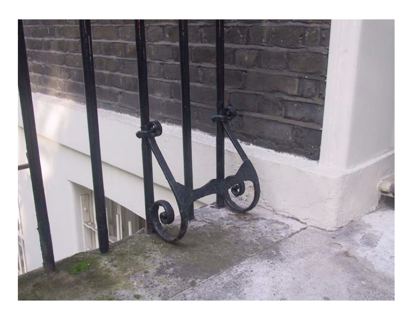
Boot scraper, Woburn Square