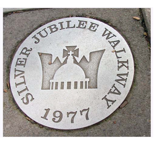
Jubilee walkway south of Woburn Square