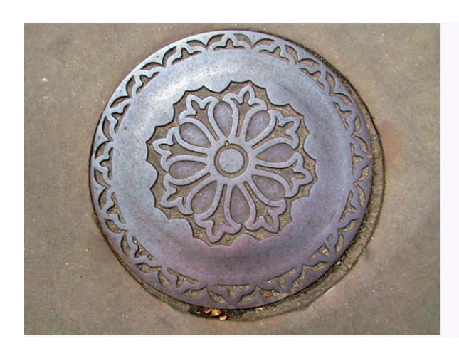
Coal cover, Gordon Square