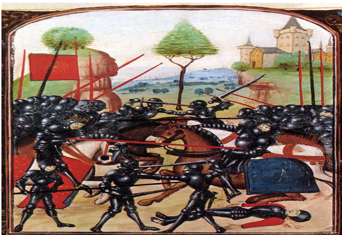
Illustration of the Battle of Barnet (14 April 1471) on the Ghent manuscript, a late fifteenth-century document